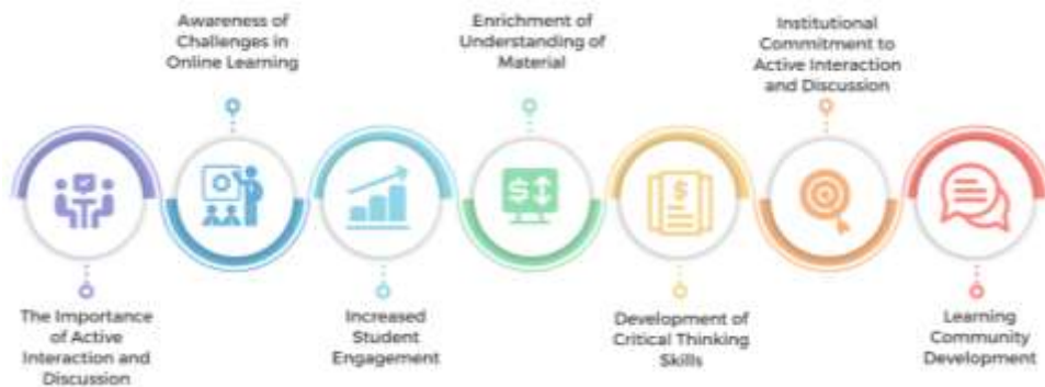
Figure 2. Massive Open Online Courses (MOOCs)

The interview results highlight the importance of interaction and active discussion in increasing student engagement in online learning. From the perspectives of both instructors and institutions, there is an awareness of the challenges faced in maintaining student participation in online settings. However, they have also found that by creating interactive discussion spaces, student engagement can be significantly improved. The interviews indicate that active discussions allow students to exchange opinions and consider various perspectives, which not only enhances participation but also enriches their understanding of the material taught. This demonstrates that interactive discussions encourage students to think more critically and deeply, going beyond mere passive reception of information. From an institutional standpoint, there is a strong commitment to supporting the use of interaction and active discussion as primary strategies in online learning. Institutions understand that active discussions not only enhance engagement but also help students develop important skills like critical thinking and communication. This initiative is also seen as effective in building a strong learning community among students, even in an online format.