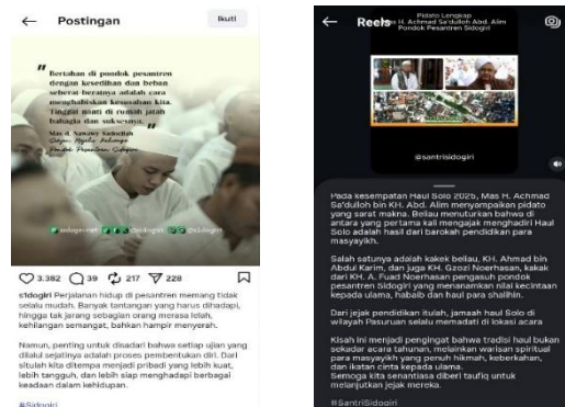
Figure 2. Screenshot Content Digital Da'wah Through Uploads From Islamic Boarding School Account Sidogiri.

Figure 1.2 is shown activity daily activities of students at Islamic boarding schools, including studying in the yellow book together and attending annual events, namely Haul Masyayikh. Posting the truth to expose travel living in a boarding school that is not always easy, lots of challenges are faced, so that some of the students feel tired, lost Spirit there are even some who almost give up. However important for realized that the exam was passed in fact, the process of forming identity, and from that, 's it students forged become more strong mentally, brave more wise in take decision, and ready to accept the consequences of whatever decision mentioned. In the picture screenshot next to it from Islamic boarding school Sidogiri, which is a haul masyayikh event that stores message haul tradition, is not just an annual event but a spiritual heritage of the masyayikh, full of service, blessings, as well as bond Love to the kyai or ulama to continue traces of the masyayikh. Results of the analysis from the Islamic boarding school sidogiri No only about theoretical teachings, but also about the real life in Islamic boarding schools that contain mark moderation, religious simplicity, social usefulness, and reverence for teachers.