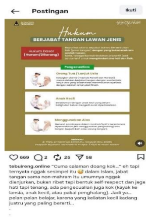
Figure 3. Screenshot Content Digital Da'wah Through Uploads From Islamic Boarding School Account Tebuireng.

Figure 1.3 researchers include proof in the form of screenshot content that discusses how the law shakes hands against type. In content the explained to Who allowed to shake hands, hand example like parents, or carry on age, child little, and brothers, and mahram. Content towards moderation, religious with convey for emphasize manners and giving one of the solutions in the form of book references in daily life. Analysis This not only conveys law in a normative way, but also in a contextual way, so that with easy understood and accepted by society.