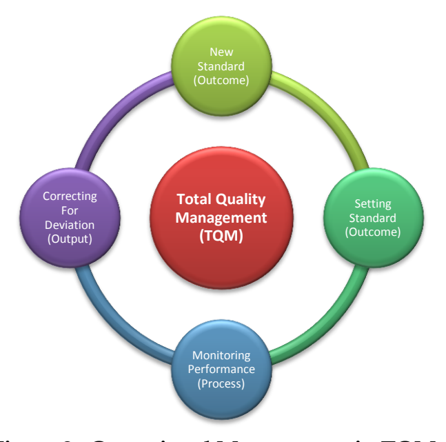
Figure 2: Operational Management in TQM

Table 1. It shows that the achievement of a world class university must be pursued through the path of total operational quality management by taking into account several elements that become the benchmarks for the use of new standardsTowards a World Class University Using the Malcolm Baldrige Criteria for Performance Excellence (EdPEx) version of the Education Performance Excellence (MBCfPE) Standard. Based on information, from 2018 to 2020 onwards the accreditation of Indonesian higher education institutions will use the following some standards: National Education Standards, National Research Standards, and National Community Service Standards: standards of community service results, community service content standards, community service process standards, community service assessment community service implementation standards, community service facilities and standards, service community management standards community, funding standards and community service financing.