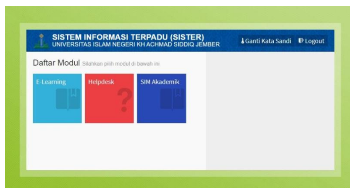
Figure 1: SISTER UIN Khas Jember Display

The first impact felt by students as users caused by the effectiveness of the managerial process at UIN Khas is the ease of using campus academic services. In this case, it refers to SISTER as one of the web-based educational service systems at UIN Khas. SISTER is a web-based application that contains integrated information related to the student concerned, such as grades, lecture program designs, data for supervisors, etc. The description of SISTER UIN Typical Jember is shown below: