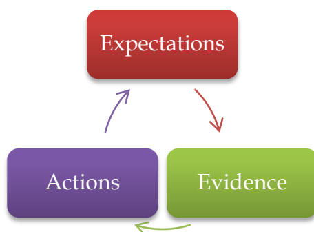
Figure 3: Madrasah High Expectation

Instructors play a significant part in changing the conduct and considering understudies towards accomplishing instructive objectives. Accordingly, instructors should survey the preparation of learning execution and leading acquiring skills (Madden et al., 2020). The skill moved by an instructor is a significant component in accomplishing understudy accomplishment (Umar, 2020). Understudy learning accomplishment is an impression of the achievement of an educator in instructing. Hussin, (2018) indicated that the instructor's job situation with the educator has suggestions for the jobs and capacities that are his obligation. Educators play a bound together and indivisible capacity between instructing, guiding, educating, and training. These four capacities are integrative capacities, which cannot be isolated from each other. Robosa et al. (2021) state that accomplishment should mirror the degrees of understudies how much they have had the option to accomplish the objectives set for each field of study. Images used to address grades, letters, and numbers should address accomplishments. Pandey, (2020) recommends that accomplishment is the worth which is the final detailing given by the educator concerning the advancement or accomplishment of understudy getting the hang of during a specific period.