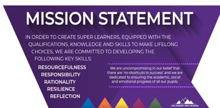
Figure 2: Madrasah Mission and Vision

The school's effort to win its objectives is highly determined by its commitment to implementing what has been formulated as its vision and mission (Dwyer, 2011). It should be noted that the purpose of the school as an educational institution is to help students to develop optimally in terms of physical, moral, social, spiritual, knowledge, and skills. The school's vision and mission should contain the values needed by all school members in carrying out their daily activities so that a professional, safe, comfortable, and familial school environment will be created. What is the vision and mission of a good school? As an illustration: A group of teachers has an agenda to take students on study tours, so one is appointed to be the coordinator. Together, discuss the goals to be achieved, the vision, and how to achieve its mission. If it is done together, all involved will feel clear about the goals to be achieved and are responsible for carrying out their duties to achieve the goals that have been set (Darling-Hammond, 2015).