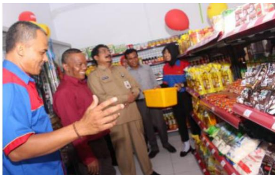
Figure 2. Inauguration of Alfamart at SMKN 1 Magetan

The data mentioned above is supported by the results of the researchers' observations on July 23, 2022. Researchers saw firsthand the industrial class program at public vocational high school 1 Magetan, as shown in Figure 2.