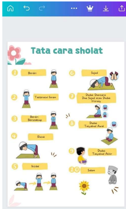
Figure 3. Material for prayer procedures

Figure 3 explains the procedures for good and correct prayer along with pictures of each movement which aims to ensure that students, especially Hulu Langat guidance students, understand how each prayer movement is good and correct. The importance of learning this prayer procedure material is to instill religious values in students that praying well and correctly is something that must be carried out. Nowadays, many students and even adults still have many wrong prayer procedures and are very difficult to correct because they are used to it. That way, these students must know how to pray properly and correctly. In Figure 3 above, the teacher not only shows how to pray but also provides direct practice.