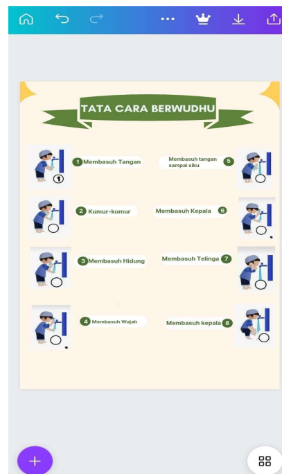
Figure 1. Material for ablution procedures

designed to be as interesting as possible makes students more quickly grasp the content of the material being taught. This statement is in line with Sanjaya and Wina's theory that the use of media can build students' energy and inspiration for learning. Apart from that, by using interactive learning media, students' interest in learning material can be expanded. The following is an example of using the Canva application in learning Islamic religion at Sanggar Guidance Hulu Langat Malaysia in the form of posters and PPTs.