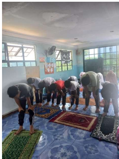
Figure 4. Prayer practices of Hulu Langat guidance studio students

Figure 3 explains the procedures for good and correct prayer along with pictures of each movement which aims to ensure that students, especially Hulu Langat guidance students, understand how each prayer movement is good and correct. The importance of learning this prayer procedure material is to instill religious values in students that praying well and correctly is something that must be carried out. Nowadays, many students and even adults still have many wrong prayer procedures and are very difficult to correct because they are used to it. That way, these students must know how to pray properly and correctly. In Figure 3 above, the teacher not only shows how to pray but also provides direct practice.