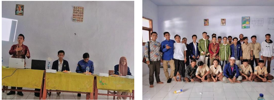
Figure 3. Documentation of the Implementation of Legal Counseling about the dangers of drug abuse for the younger generation at Madrasah Aliyah Bustanul Faizin Besuki, Situbondo Regency

It is required to hold legal counseling about the risks of drug misuse for the younger generation at Madrasan Aliyah Bustanul Faizin Besuki Situbondo Regency because, according to the findings of an initial survey in the field undertaken by this service, there are still many young people who use drugs.