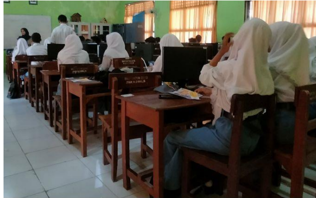
Figure 3. Situation of Implementation of Community Service Activities