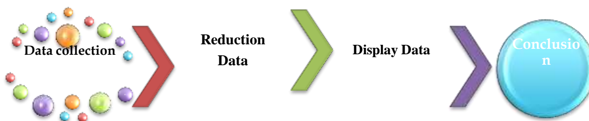
Figure 1.2 Data Collection Flow

From the table, it can be explained that there are four sources of informants (Rukajat, 2018); Principal, Deputy Curriculum, Class Teacher, Students, and guardians. Furthermore, observations were carried out at several meetings with direct observation of the quality control circle management activities at the institution (Luthfin & Hidayati, 2022). The last step is document analysis that can support the research results. The flow of data collection activities to obtain results or conclusions can be seen in Figure 1.2