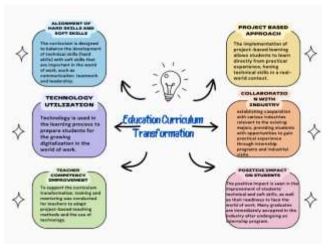
Figure 1: Education Curriculum Transformation

In an interview with the Principal of SMK Darussalam Blokagung, he explained that the school cooperates with various industries that are relevant to the existing majors. This cooperation aims to provide students with practical experience directly related to the world of work. Internship programs and industry visits are an integral part of the curriculum, giving students the opportunity to learn from real experiences and preparing them for professional challenges. In addition, the school also invites industry practitioners to give guest lectures, so that students can gain insights directly from experts in their fields, enriching their knowledge with the latest information and experiences from the industry.