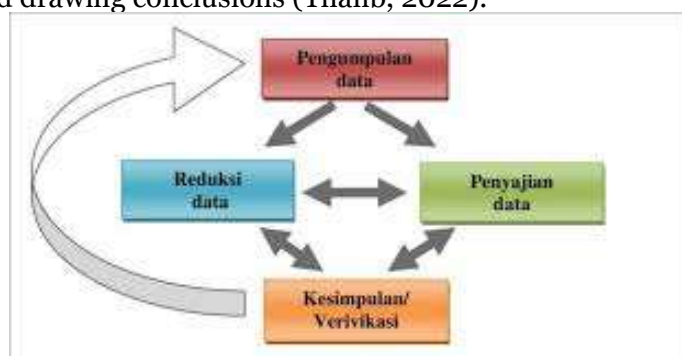
Table 1.1 Miles and Huberman Data Analysis

After the observation stage, the collected data was analyzed qualitatively using the Miles and Huberman data analysis model, which includes data reduction, data presentation, and drawing conclusions (Thalib, 2022).