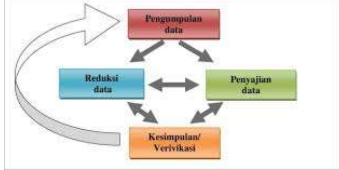
Table 1.1 Miles and Huberman Data Analysis

After the observation stage, the collected data was analyzed qualitatively using the Miles and Huberman data analysis model, which includes data reduction, data presentation, and drawing conclusions (Thalib, 2022).