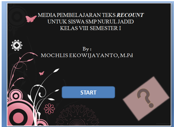
Picture 2. Display screen on the main menu .