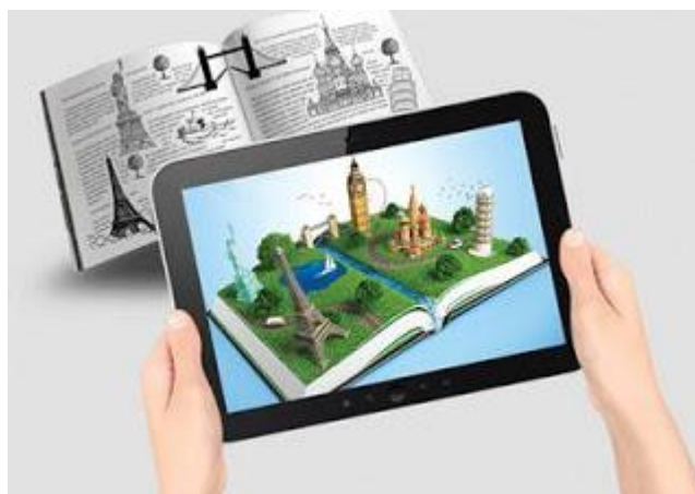
Figure 2 The example of Augmented Reality.

Based on object-tracking techniques, the augment system is divided into 3 types, namely positioning , marker , and markerless augmented reality services. The type of augmented reality positioning system is quite simple in its use. This system uses position as a marker , so it is usually combined with GPS on a smart phone. This type of augmented reality mark system uses techniques to detect markers that have been pre-programmed to be recognized. A marker is in the form of a square with a white background and with several black shades. These two colors are more often used because of the effect of light sensitivity on black and white so that it is easy to detect. This type of marker is commonly referred to as a static marker. But there are abstract forms. Marker types are often also categorized as markerless in the form of complex patterns consisting of writing, drawing, or color. This media enables the students to enrich their vocabularies, and also reading comprehension.